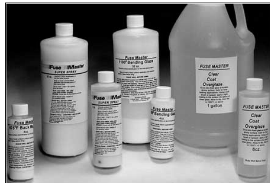
The FuseMaster family of fine overglaze products.

Soak ceramic fiber products in this hardener to give them rigidity. Fiber mold hardener can be used with fiber paper, fiber board and fiber blanket. Once applied fire to 1200°F in a vented area and kiln to burn out the binder and to cure the mold. The resulting durable fiber forms can be used for bending molds, support walls, kiln furniture or other high temperature forms. Perfect for making drop-out rings.